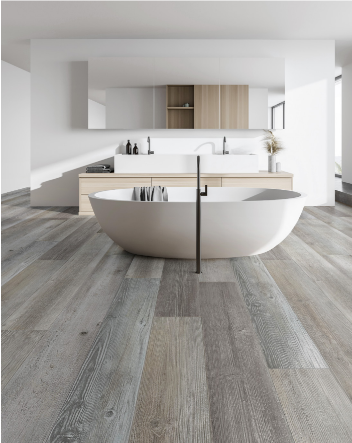
FADED OAK CC44148C