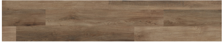
CLASSIC OAK CC44193C