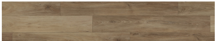
EURO OAK CC44106C