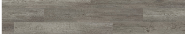
DOVER OAK CC44104C