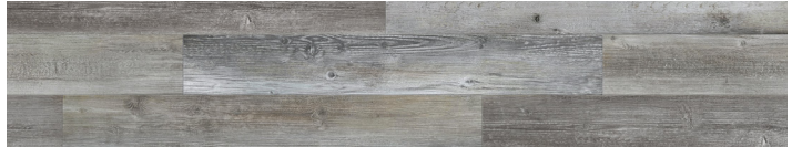
FADED PINE CC44133C