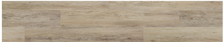
GREY OAK CC44122C