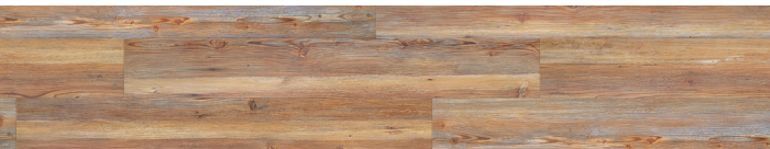
SOUTHERN PINE RC42141G