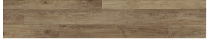
EURO OAK RC42104G