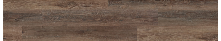
RUSTIC WALNUT RC42191G